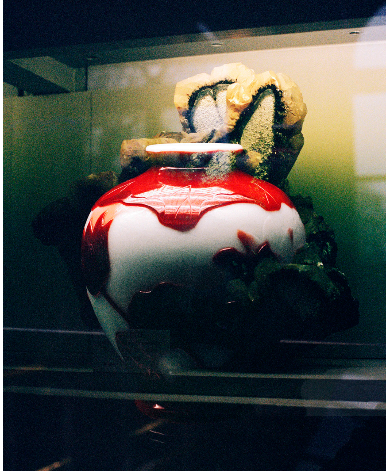
Daniela Ângelo Untitled , 2023 Inkjet print on paper 55 x 45 cm Ed. 1/3 + 1 AP