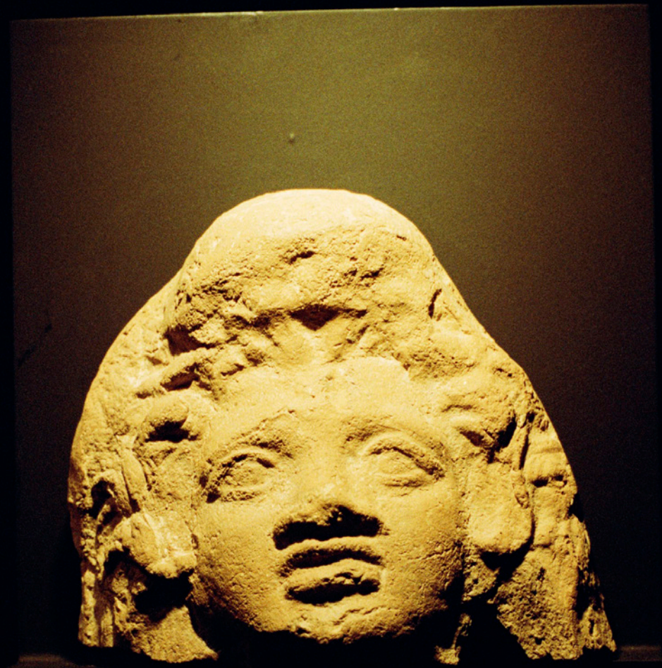
Daniela Ângelo Untitled , 2023 Inkjet print on paper 110 x 100 cm Ed. 1/3 + 1 AP