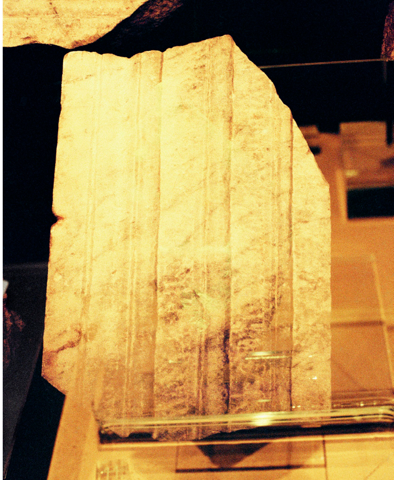
Daniela Ângelo Untitled , 2023 Inkjet print on paper 135 x 110 cm Ed. 1/2 + 1 AP